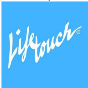
Photo Information - Worth Hall

Date: Friday, Aug 18 Time: 2:00 pm - 9:00 pm